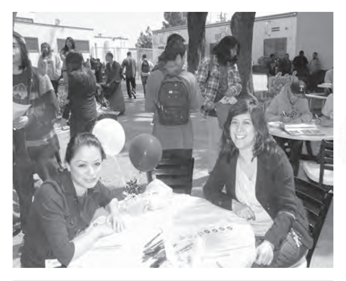
Los Angeles Trade-Technical College