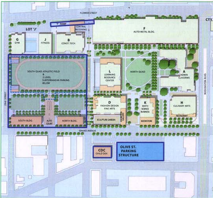
PROPOSED 5 YEAR CAMPUS PLAN

EXISTING BUILDINGS NEW BUILDINGS SUBTERRANEAN PARKING ABOVE GRADE STRUCTURE PARKING