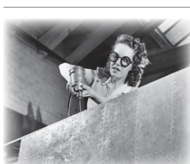
During WWII, thousands of “Rosie the Riveters” enrolled at Trade Tech, lending their skills to support the war effort.