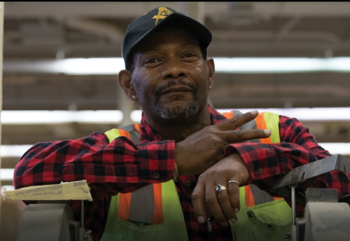
CONSTRUCTION Maintenance & Utilities Pathway