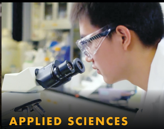
APPLIED SCIENCES Pathway