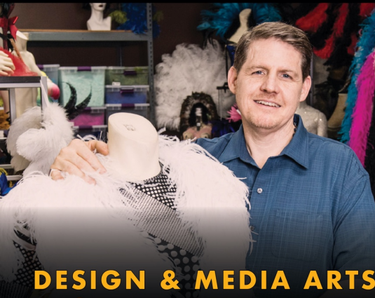
DESIGN & MEDIA ARTS Pathway