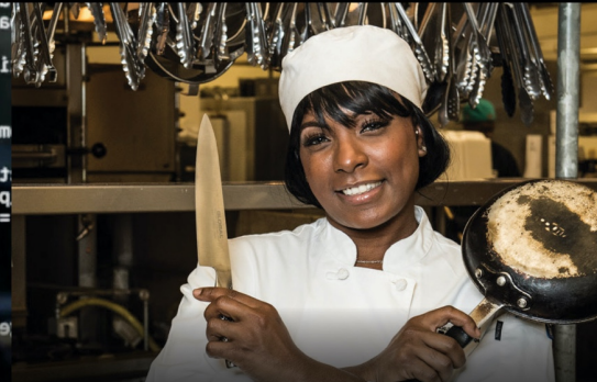
CULINARY ARTS Pathway