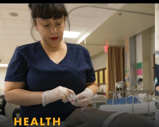
HEALTH & Related Sciences Pathway