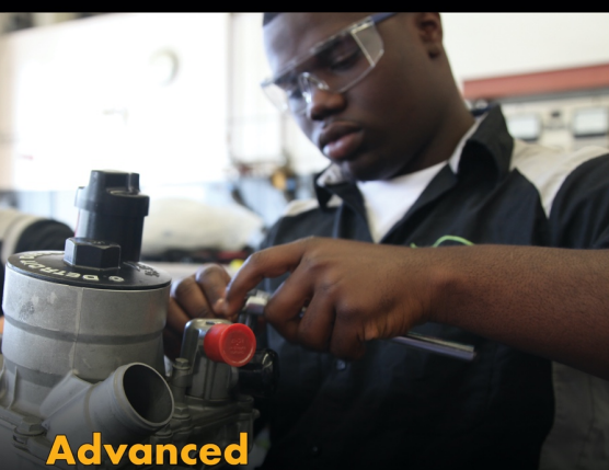
Advanced TRANSPORTATION & Manufacturing Pathway