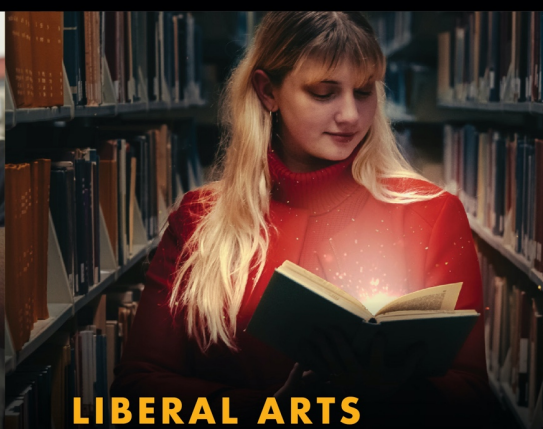
LIBERAL ARTS & Transfer Prep Pathway