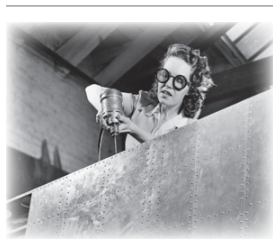
During WWII, thousands of "Rosie the Riveters" enrolled at Trade Tech, lending their skills to support the war effort.

The advent of World War II created an exponential demand for the college's training programs in support of the war effort. The college's Aircraft and Welding Trades departments operated directly under the supervision of the federal War Production Training Program, while the majority of other programs were quickly reformatted to provide short-term training of six to ten weeks in duration, often at war production plants located throughout the city.