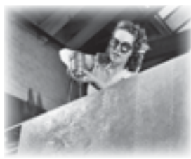
During WWII, thousands of "Rosie the Riveters" enrolled at Trade Tech, lending their skills to support the war effort.

The advent of World War II created an exponential demand for the college's training programs in support of the war effort. The college's Aircraft and Welding Trades departments operated directly under the supervision of the federal War Production Training Program, while the majority of other programs were quickly reformatted to provide short-term training of six to ten weeks' duration, often at war production plants located throughout the city.